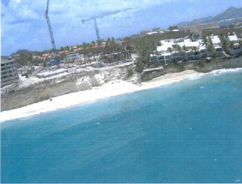
Aerial photo of Cupecoy Beach