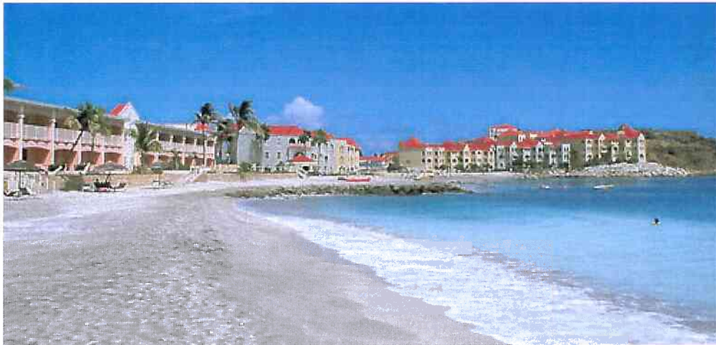
Little Bay Beach