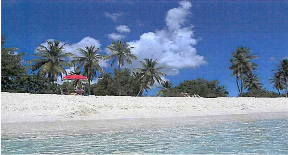
Mullet Bay, photo by Kampi, found using Google Earth