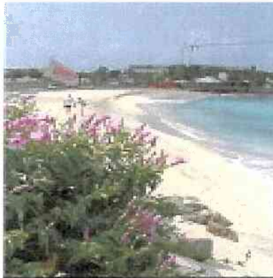
Maho Beach, photo from http://www.sint-maarten.net/St-Maarten-Beaches/MahoBay.html

Presently the chairs and umbrellas are provided by the hotel on the Western side of the beach. The picture below on page 27 displays the proximity of the beach to the landing aircrafts.