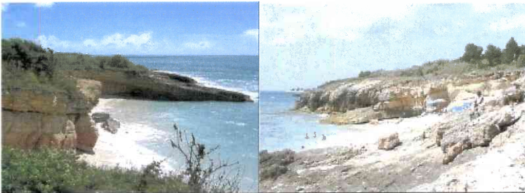
Cupecoy Beach

Evidently, this has made setting up chairs and umbrellas very difficult. Presently, one vendor is operating on that beach. Due to the constant erosion of the beach, no more vendor permits will be issued for the Cupecoy Beach.