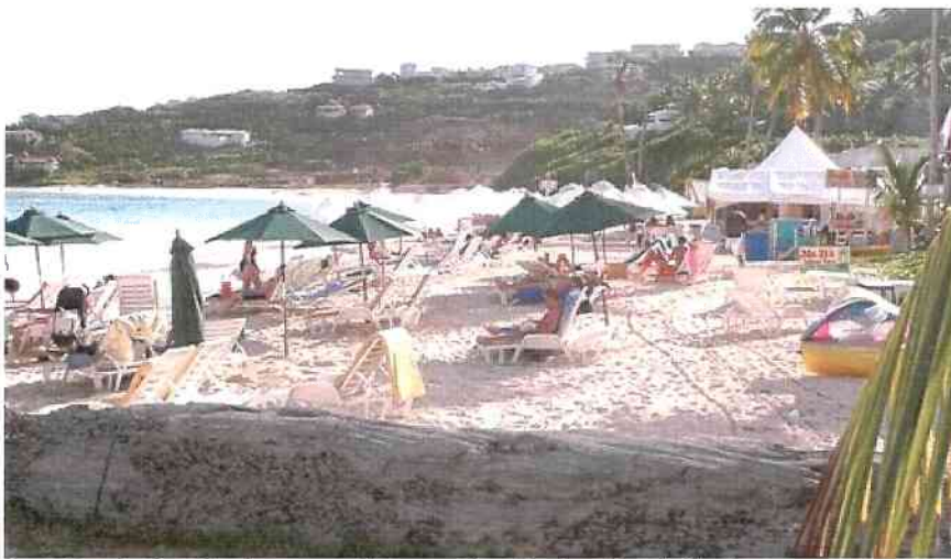
Dawn Beach

Dawn Beach is located to the Eastern side of St. Maarten between Oyster Bay and Guana Bay. The beach extends from Westin in the North to the French border, which consists of elevated rocks running perpendicular to the shoreline.