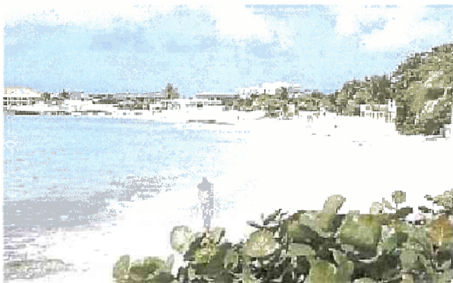
Burgeaux Bay, photo from http://www.sint-maarten.net/St-Maarten-Beaches/BurgeauxBay.html

No defined borders have been established for this beach.