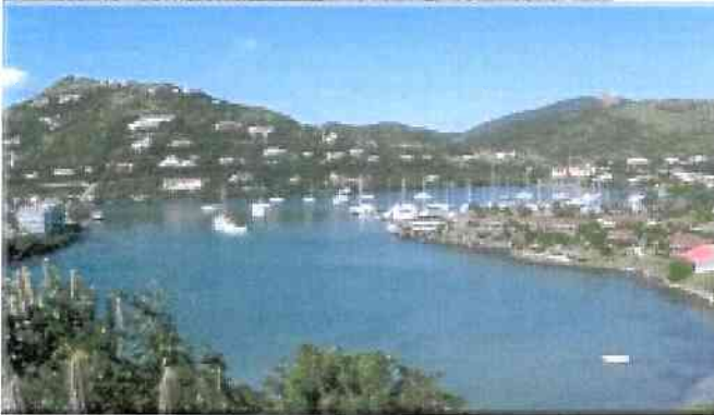
Oyster Pond, photo from http://www.sint-maarten.net/St-Maarten-Beaches/OysterPond.html