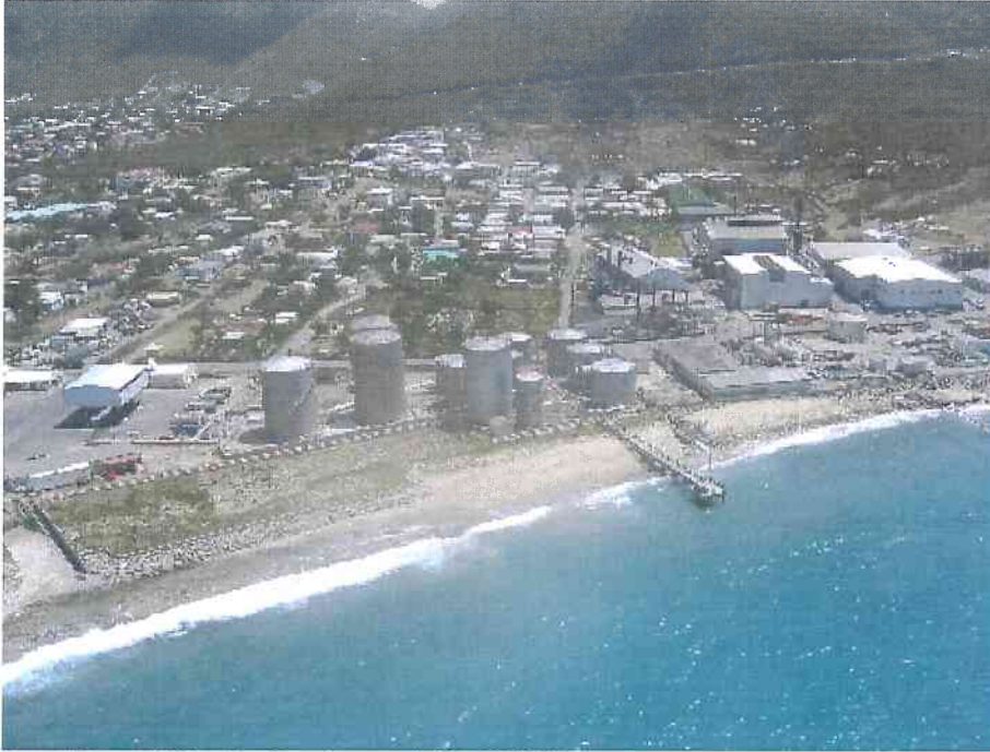
Aerial Photo of Cay Bay Beach